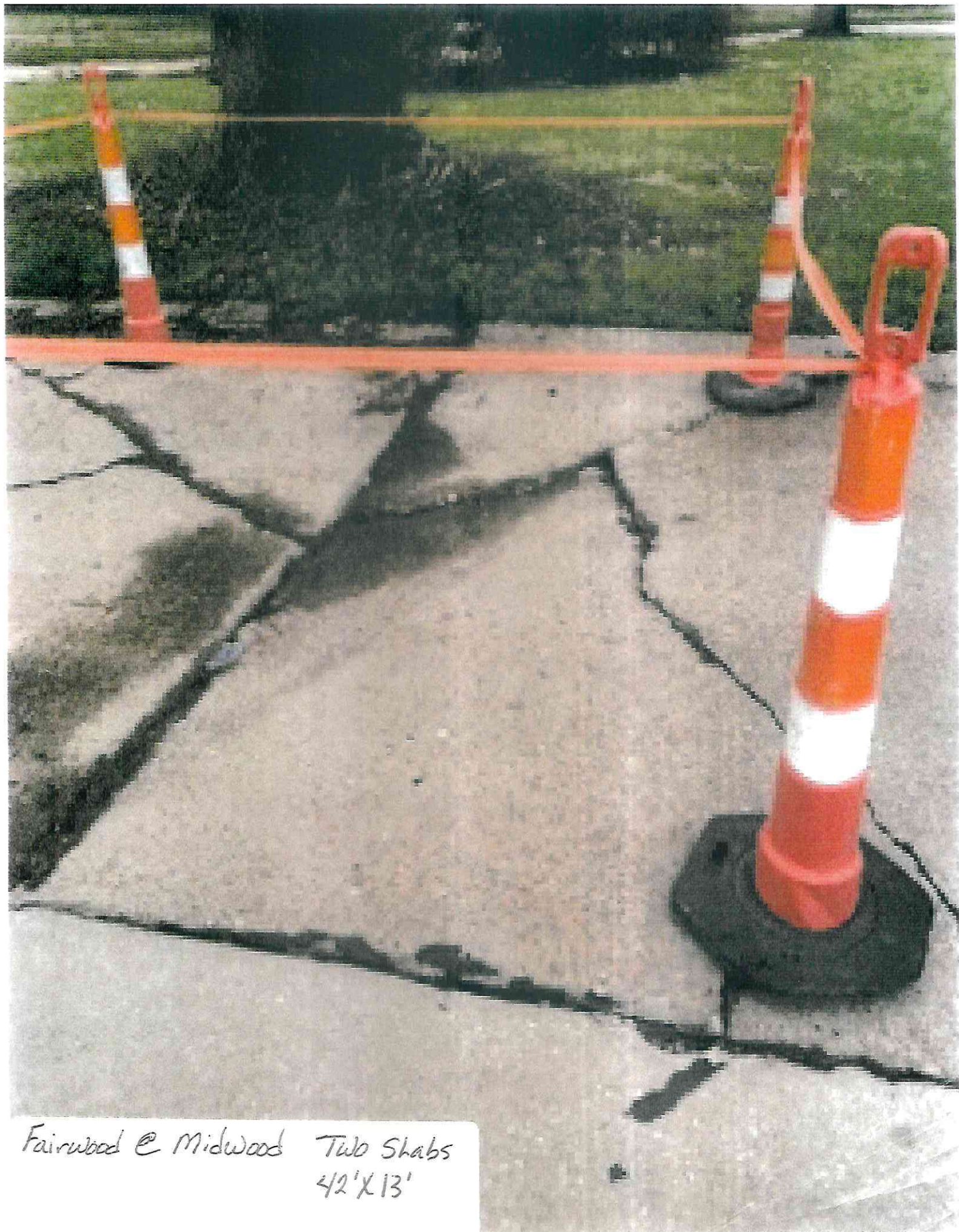
Fairwood @ Midwood Two Slabs 42'X13'