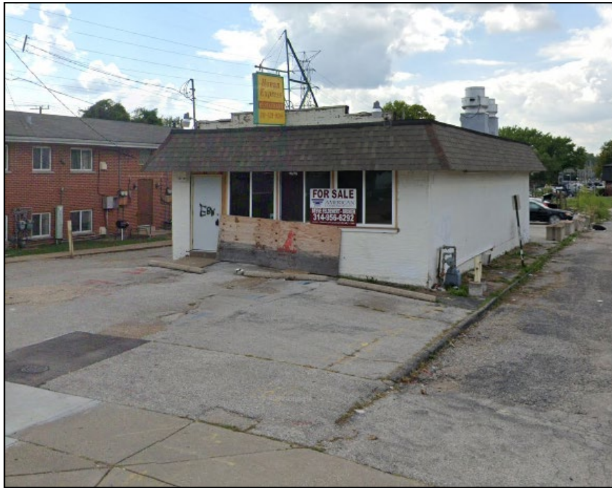
8620 Frost Avenue; Front view showing front parking spaces

8425 Airport Road Berkeley Missouri 63134-2098 (314) 524-3313