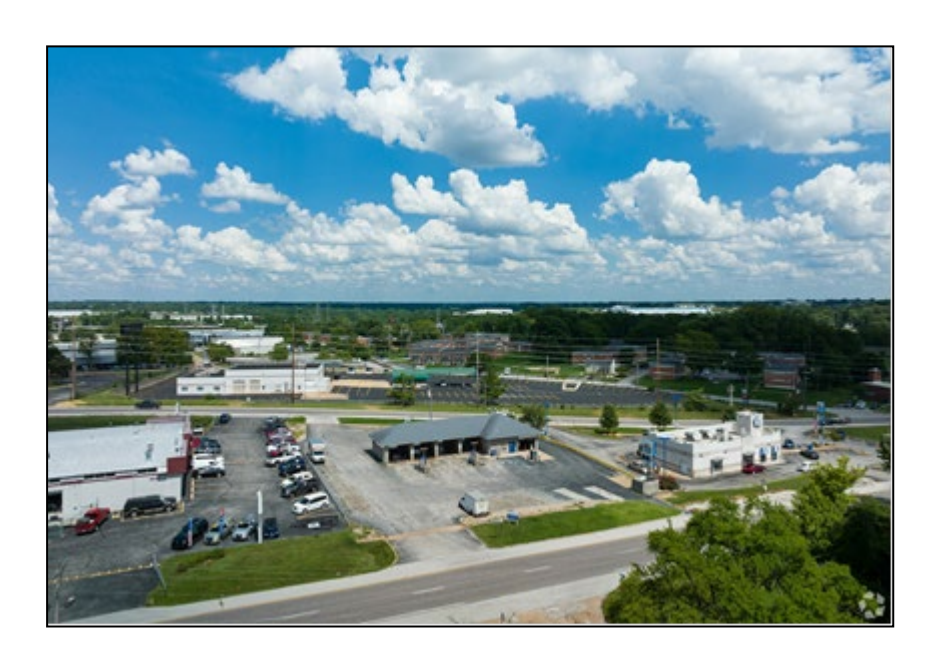
9310 Natural Bridge Road; Aerial photo of site.