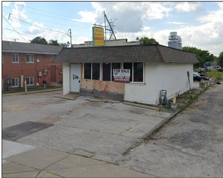
8620 Frost Avenue; Front view showing front parking spaces

8425 Airport Road Berkeley Missouri 63134-2098 (314) 524-3313