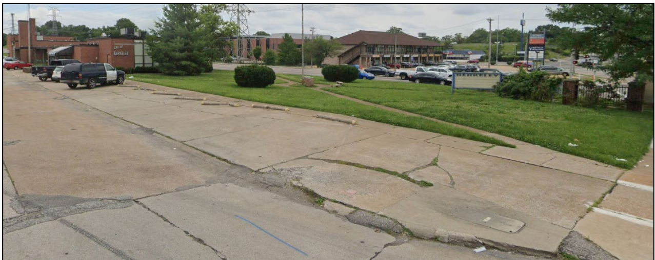
Looking south from Airport Road and Madison Avenue