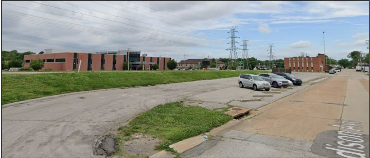
Looking north to Airport and Hanley Roads