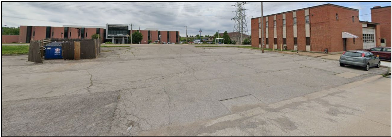
Center section showing dumpster enclosure